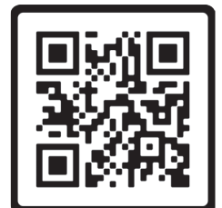
Scan for the most up-to-date information